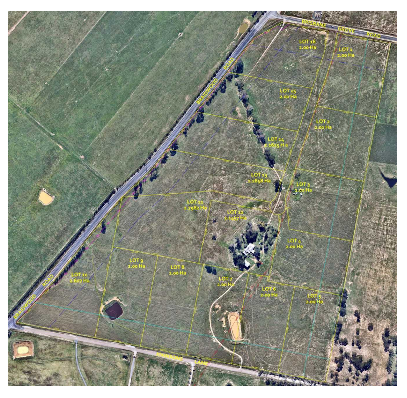
Allfarthing draft subdivision plan