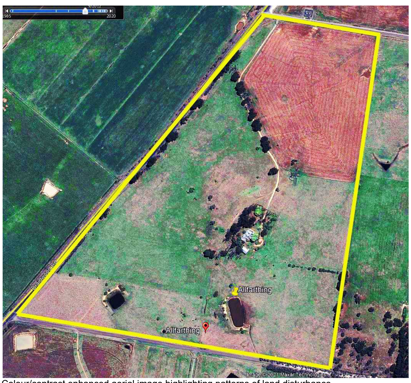
Colour/contrast enhanced aerial image highlighting patterns of land disturbance.