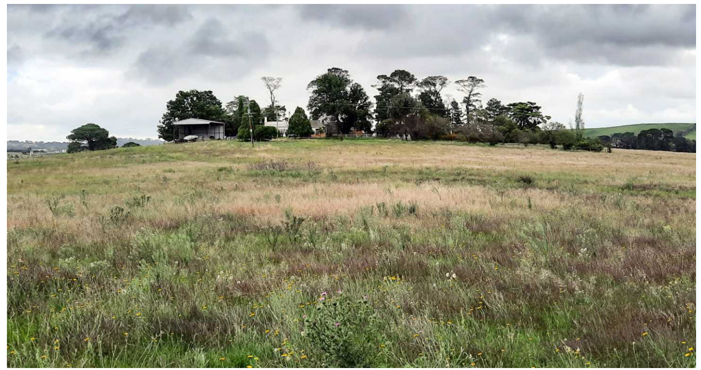
View of the development area: Allfarthing cottage is located on the crest of this grassed slope.

Due Diligence Investigation for the Protection of Aboriginal Objects Allfarthing, 2 Brisbane Grove Road, Brisbane Grove, NSW Lot 60 DP1090981 & Lots 61-64, 71-77 DP976708