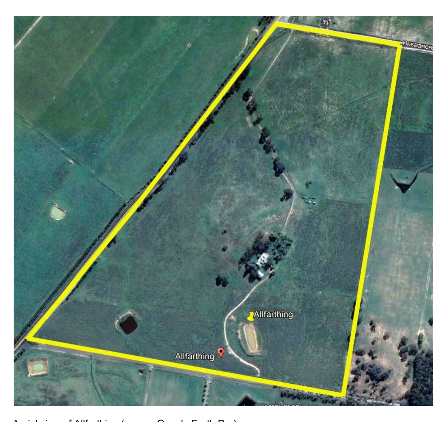
Aerial view of Allfarthing